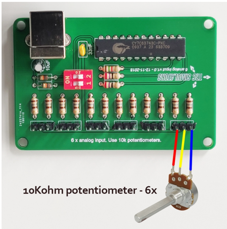
10Kohm potentiometer - 6x